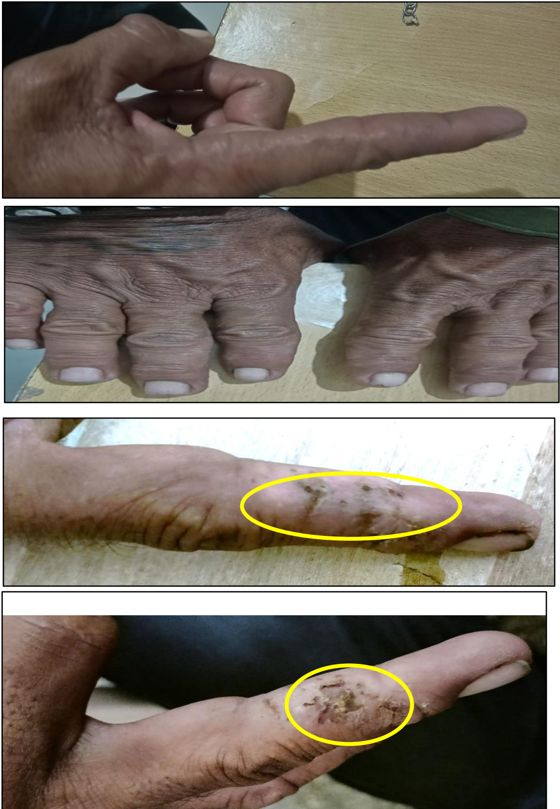
Figure 1 Before treatment