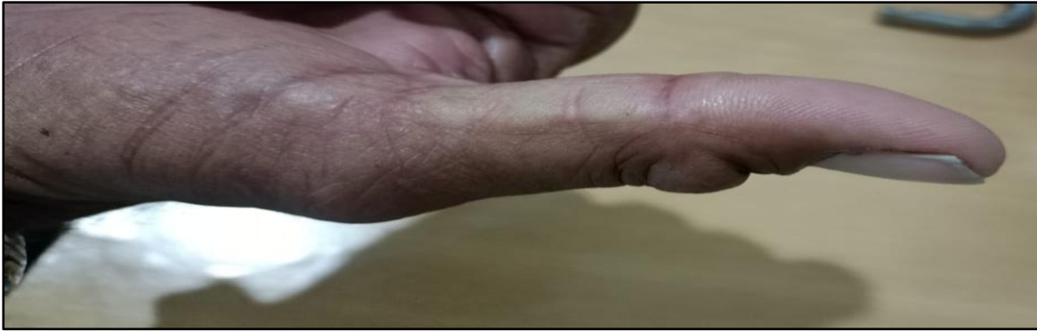
Figure 2 After 15 days of treatment